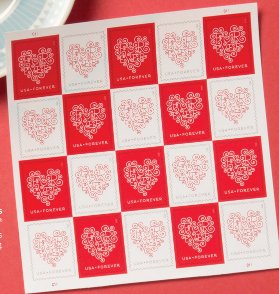
Forever Hearts First-Class Rate Forever® Pane of 20 stamps $9.80 588504