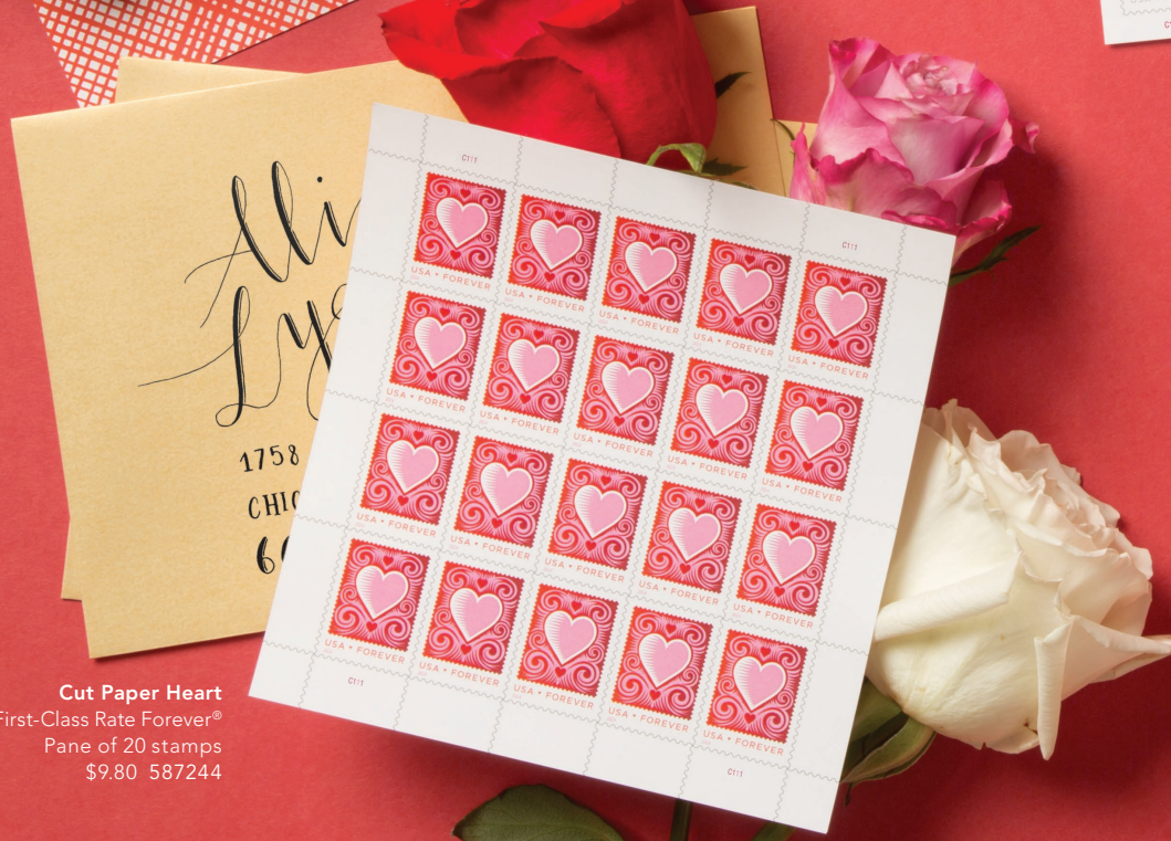
Cut Paper Heart First-Class Rate Forever® Pane of 20 stamps $9.80 587244